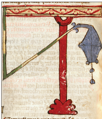
Fig. 2: Vaginal speculum. From a 14th-century Latin copy of al-Zahrawi's Surgery .

upside-down, with the blades being mistakenly depicted as a decorative bar. The 6-lobed shape at the foot of the illustration, which ought to be the screw, clearly had no mechanical function. The lantern-shaped device suspended at the right misrepresents the scalpel, which has now been integrated into the speculum. 7,8 Such distortions show that, in the 14th century, the Western world had much to learn from the physicians of the Islamic world.